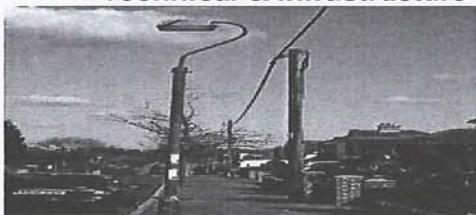
Figure 1: Example of an Insulated Bundle Electric Network

All suburbs in Ward 39 (Irene Park, Flamwood, Adamayview) where trees are competing with Electrical Distribution network, need to be changed to Insulated Bundle Electric Wire Budget Costing: R5 000 000.00 per suburb per year